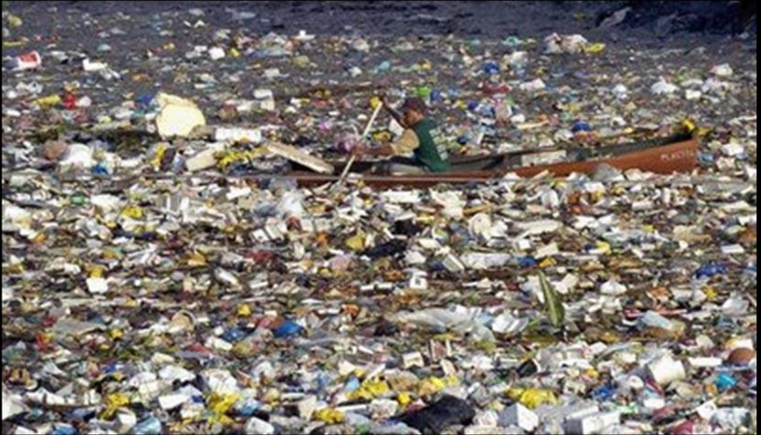
Photo of Pacific Ocean Year 2004